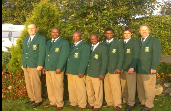
SA Team to Norway